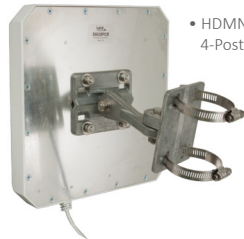
• HDMNT with 4-Post Configuration