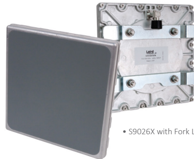
• S9026X with Fork Lift Mount