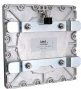
• Fork Lift Mount

Laird offers various mounting options providing flexibility and maximum performance from your antenna.