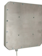
• VESA Mount (Hole Pattern Only)