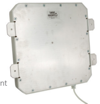
• Flush Mount