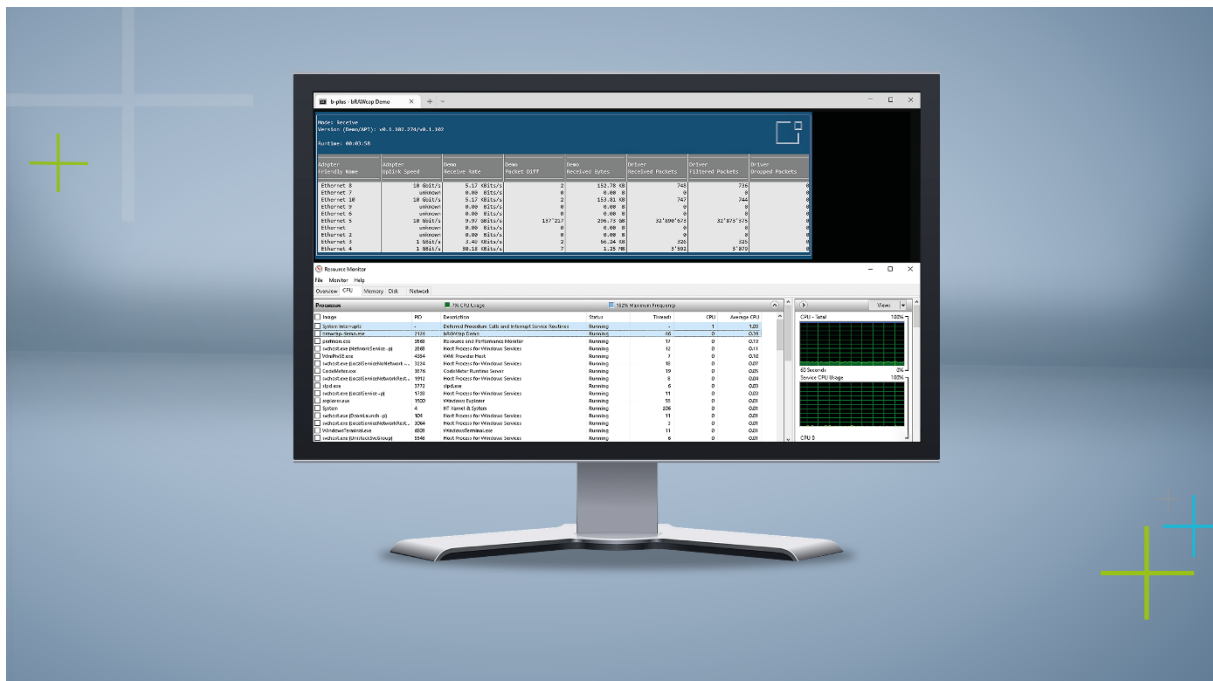
Product Picture: Windows Driver bRAWcap

Software solution for efficient tapping and replay on 10G Ethernet interfaces available in full-features version from October