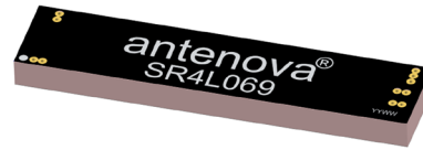
Allani 4G/5G SMD antenna

Allani, Antenova's 5G and 4G LTE compatible antenna, is the most compact, high performance, surface mountable antenna the company has ever created. The antenna requires minimal space on your circuit board, enabling you to futureproof your device for 5G and achieve high levels of performance right now.