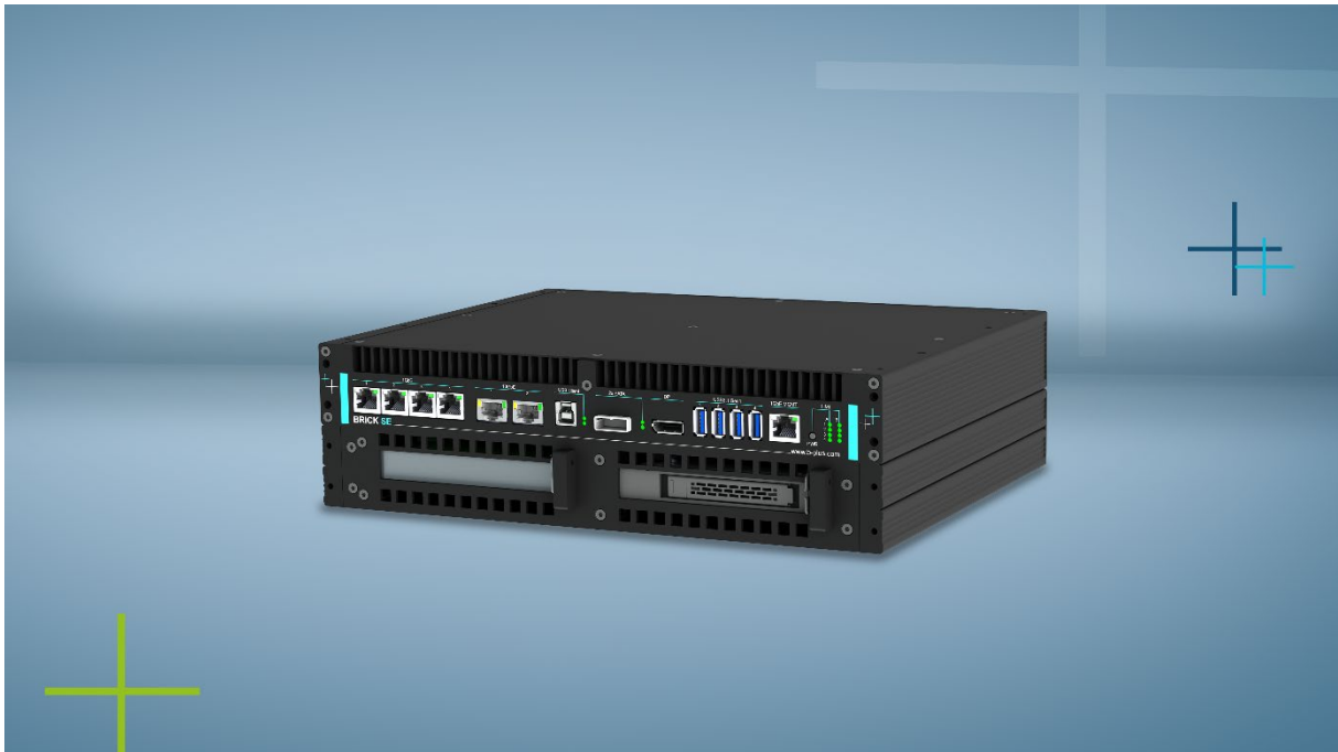
Product Picture: Ethernet Recorder BRICK SE

b-plus presents the brand new BRICK SE data logger for various industrial applications