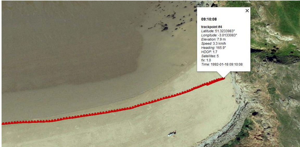
Figure 3: Start location and initial path

Figure 4 shows the limit of reliable data at 964 meters.