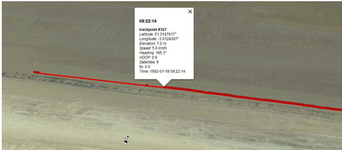
Figure 4: End location

Figure 4 shows the limit of reliable data at 964 meters.