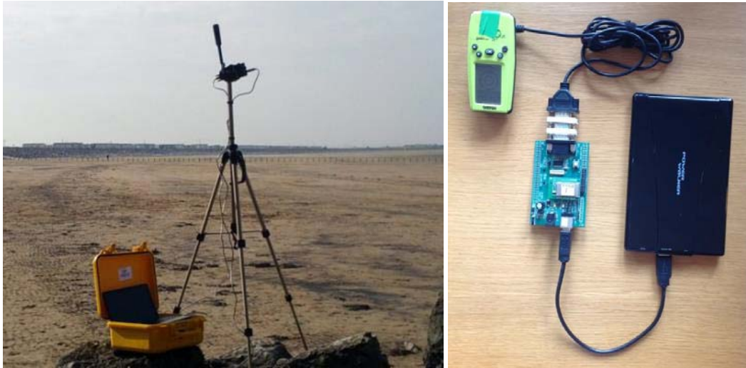
Figure 1 and 2: Module A (static) on left and Module B (mobile) on right

The modules used no more than the maximum of 18dBm transmit power for the duration of the test.