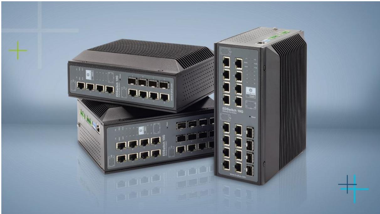
Product picture: EDSwitch 10G variants

b-plus presents EDSwitch 10G for mobile applications with or without PoE support