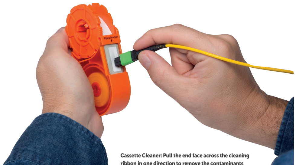
Cassette Cleaner: Pull the end face across the cleaning ribbon in one direction to remove the contaminants

Regardless of the chosen cleaning method—dry or wet—the goal stays the same: enabling high-quality transmission in optical fibre connections. Regular cleaning, combined with skilled connecting and meticulous maintenance practices, safeguards the integrity of high-density fibre optic systems, ensuring the seamless flow of information across networks amid the increasing demands of data transmission. 🌐